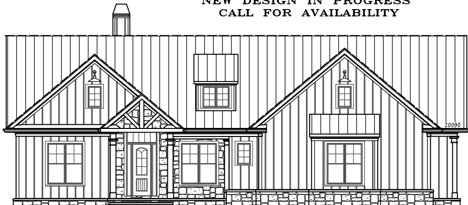
FRONT ELEVATION - A

NEW DESIGN IN PROGRESS CALL FOR AVAILABILITY