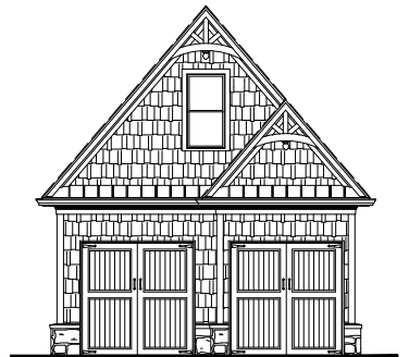
OPT. FRONT ENTRY GARAGE