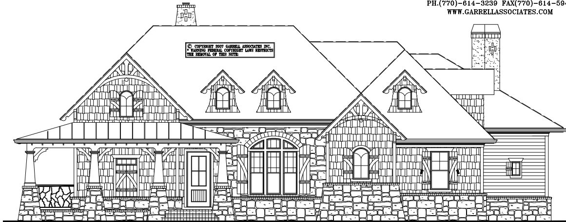
FRONT ELEVATION "B"