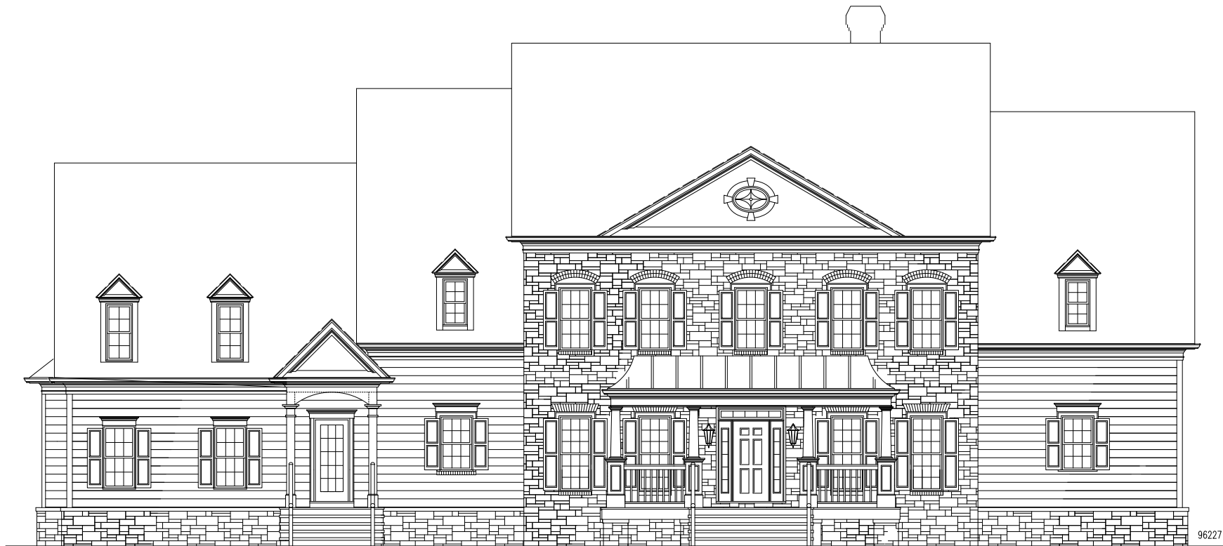
STONE & SIDING ELEVATION

5991 PARKWAY NORTH BLVD., SUITE D CUMMING, GA 30040 PH.(770)-614-3239 FAX(770)-614-5948 WWW.GARRELLASSOCIATES.COM