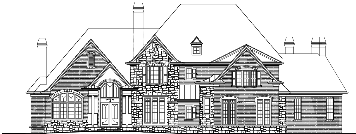
BRICK, STUCCO & STONE ELEVATION