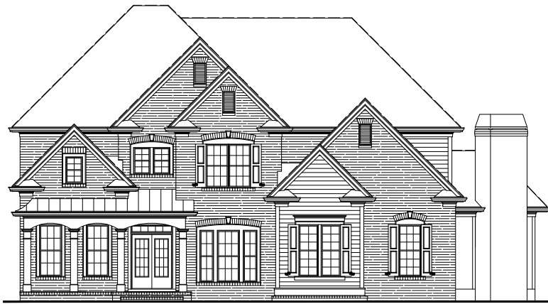
FRONT ELEVATION-ELEV. "A"