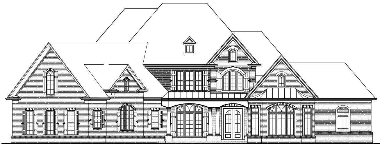
ELEVATION A - BRICK