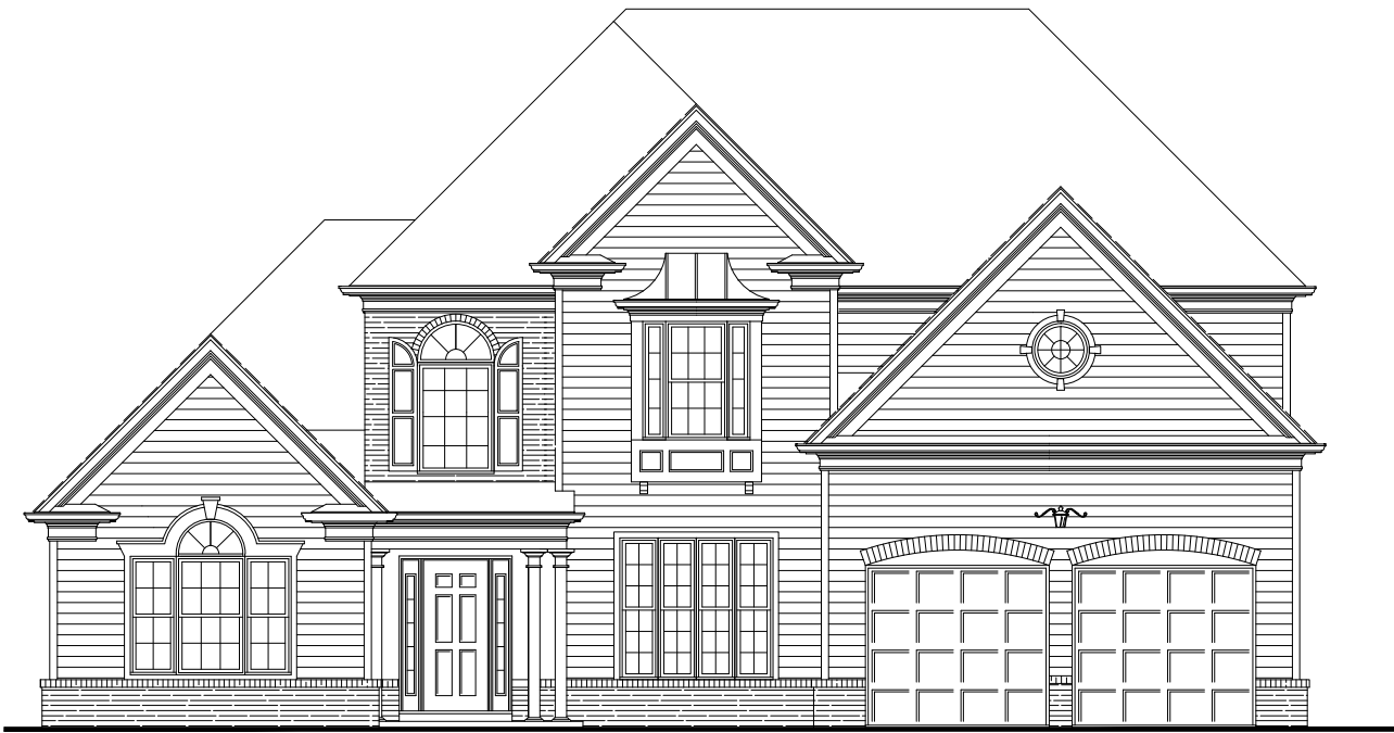
BRICK & SIDING ELEVATION ELEVATION "B"