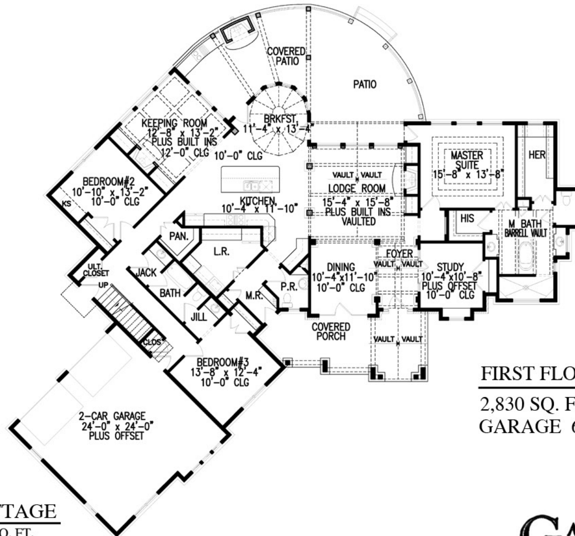
FIRST FLOOR PLAN 2,830 SQ. FT. GARAGE 625 SQ. FT.