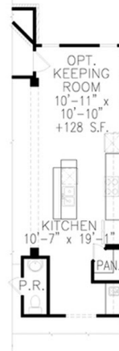
FIRST FLOOR PLAN 1,568 SQ. FT. GARAGE 440 SQ. FT.