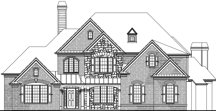
BRICK & STONE ELEVATION