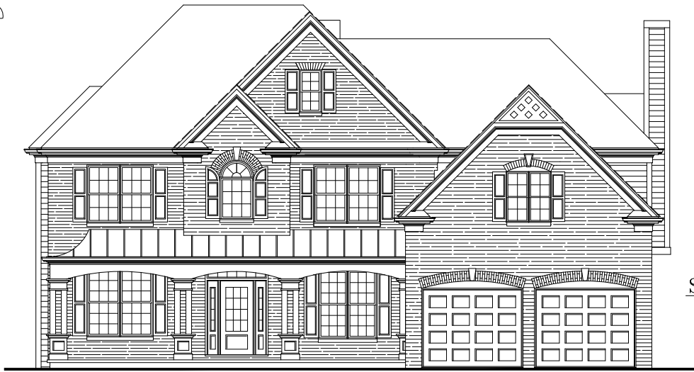
BRICK ELEVATION "A"