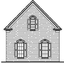
SIDE ENTRY OPTION